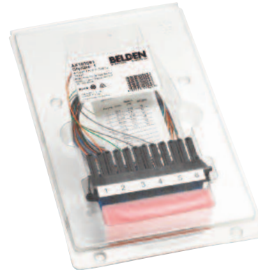
FiberExpress Ultra Frame with Pigtails